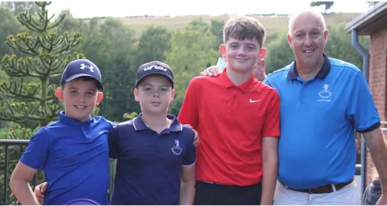
This year's winning team

Thank you to everyone who helped to make the Golf Day at Leominster Golf Club another super day. We raised over £900. Thanks to the Club, all of you who took part, Central Roofing for their sponsorship, to those who came along to help, and to the weather which was very kind to us!