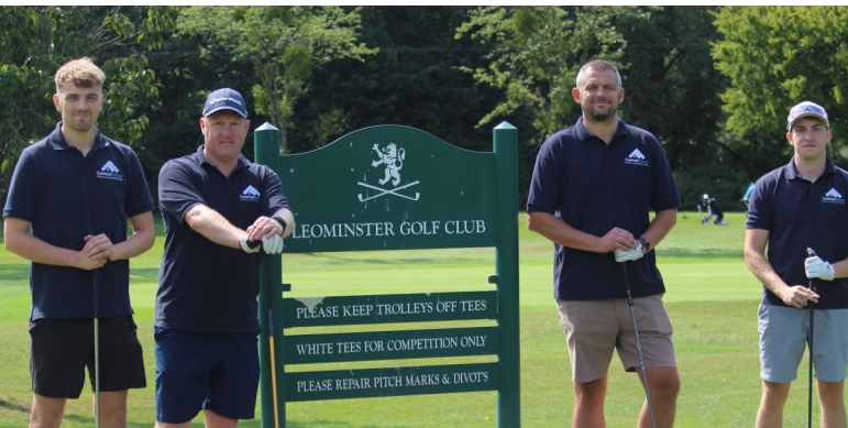
Sponsors Central Roofing: