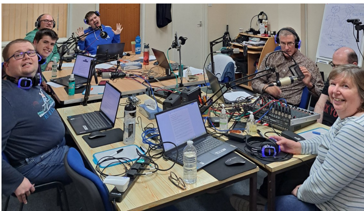
(Left) The team at Radio ECHO: Live! Every Tuesday, 1.30pm.