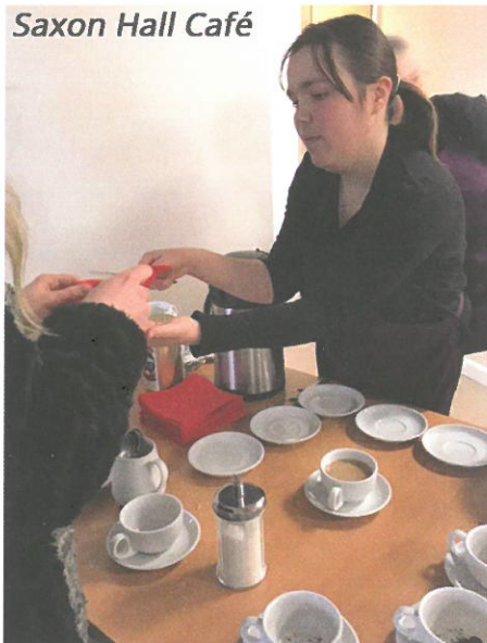
Saxon Hall Café

Saxon Hall Café , alongside the community centre itself, was officially opened in October. The Lady Mayoress opened the café along with a representative from the Co-op and Lottery who funded it. The café also provided the opportunity for four of our participants to take and pass their Level One Food Hygiene Certificate. This qualification is recognised in the industry and is a great qualification to have if they decide they would like to have a job in catering.