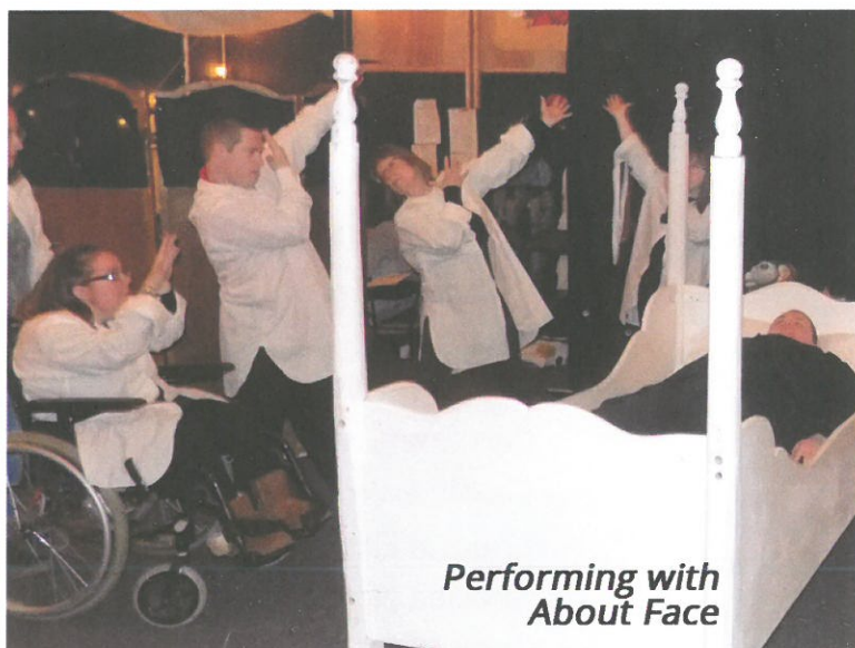
Performing with About Face

"I volunteer for About Face and have done for two years. We do singing, dancing, plays, puppetry and we work as a team - that's the thing I enjoy the most.