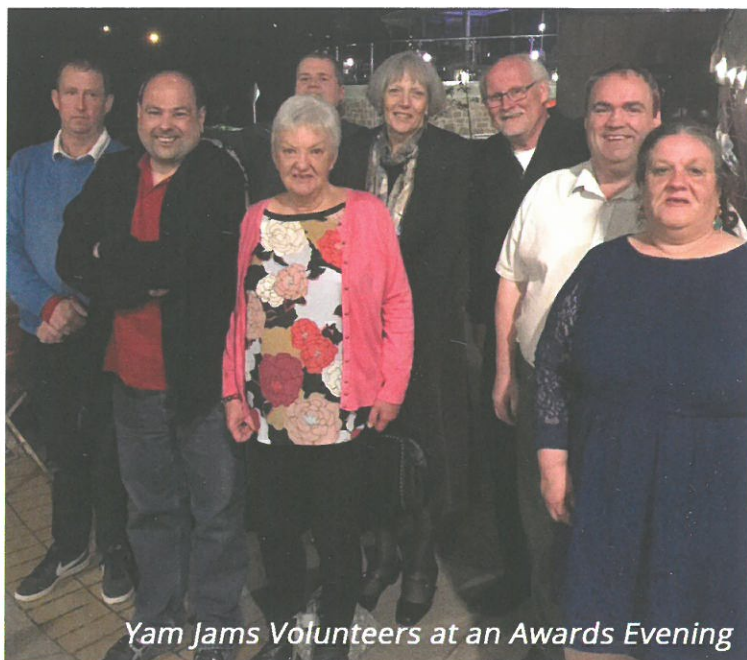
Yam Jams Volunteers at an Awards Evening