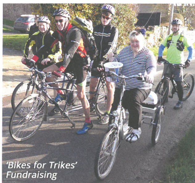
'Bikes for Trikes' Fundraising

A good example of partnership working continues to be the Yam Jams music workshops, run jointly with The Music Pool . This collaboration allows over 120 people each week to take part in interactive music sessions.