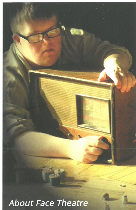
About Face Theatre

ECHOfest also returned this year and was bigger than ever with support from Leominster Town Council and S & A produce. Nine hours of entertainment saw music, theatre, circus skills and inclusive dance return once again to Leominster. The weather was glorious and proceedings were opened by the Mayor of Leominster. We see ECHOfest as a real community event, hosted by our participants, but open to