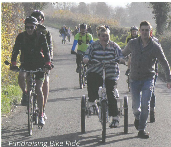
Fundraising Bike Ride